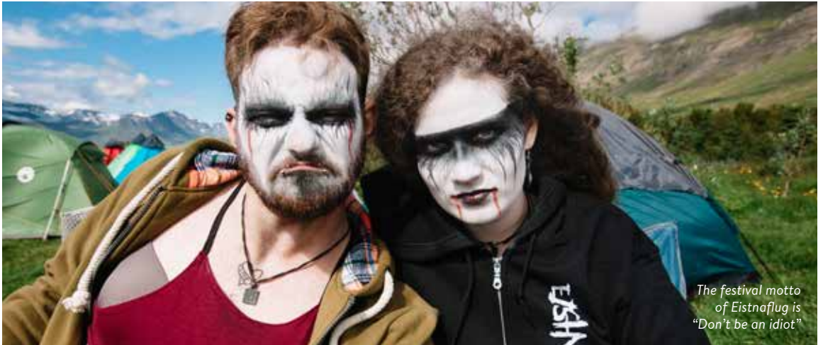
The festival motto of Eistnaflug is “Don’t be an idiot”