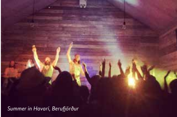
Summer in Havarí, Berufjörður