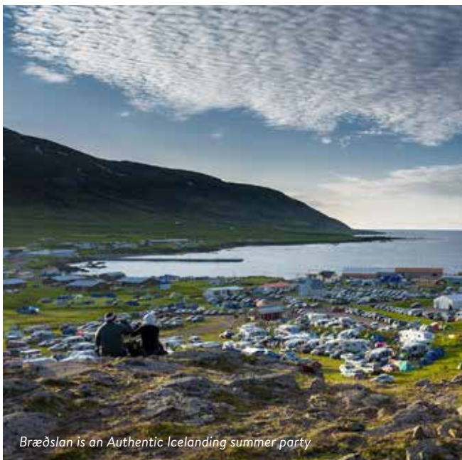
Bræðslan is an Authentic Icelandic summer party