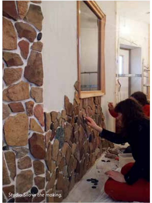
Studio Silo in the making.