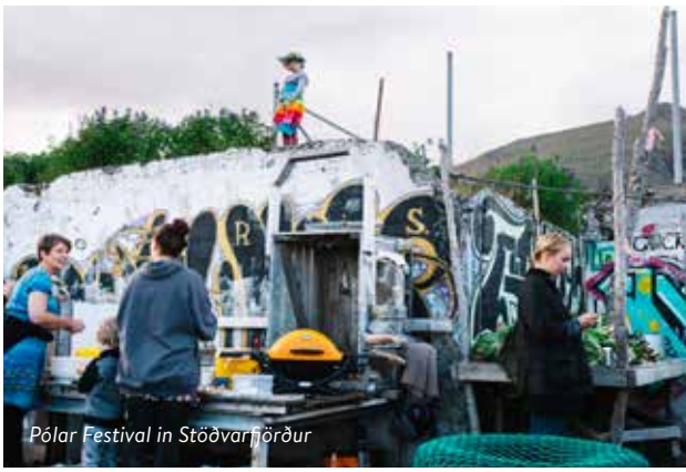
Pólar Festival in Stöðvarfjörður