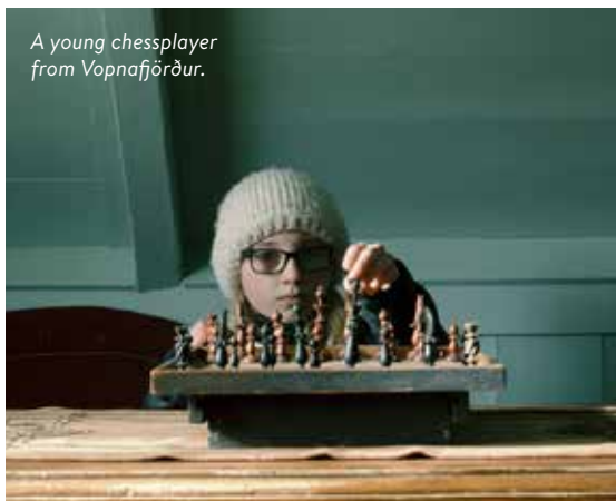
A young chessplayer from Vopnafjörður.