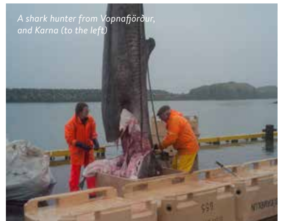
A shark hunter from Vopnafjörður, and Karna (to the left)

“IT WOULD HAVE BEEN EASY to edit the film in a manner where only smiling faces on a sunny day were shown - making it look like a bank commercial - but how does the viewer respond to that kind of storytelling? Does he come out of the cinema thinking: Now that was a good film because it showed the town in a positive light! I’d rather believe that a film touches people because it reveals something from underneath the surface, a version of reality. And that was the very thing we tried to capture: A glimpse of a reality”.