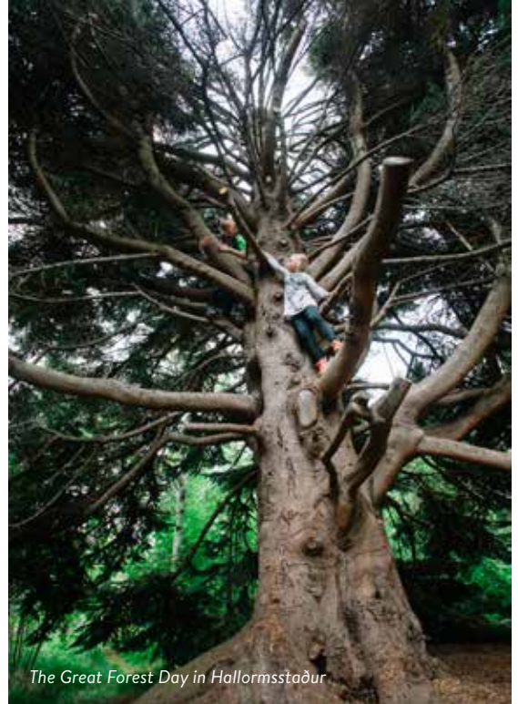
The Great Forest Day in Hallormsstaður