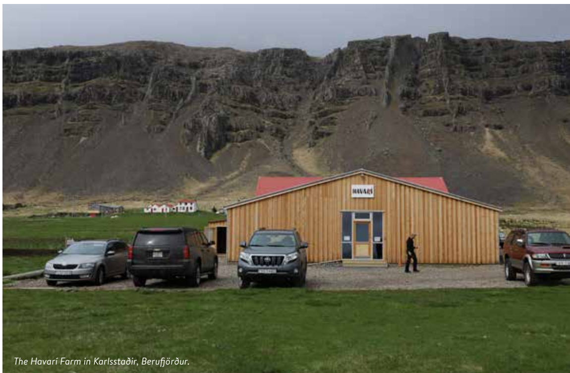
The Havari Farm in Karlsstaðir, Berufirður.

The new album, released this summer, was mostly done at the farm. Does it make life difficult having to do all the work out here in the "wilderness"?