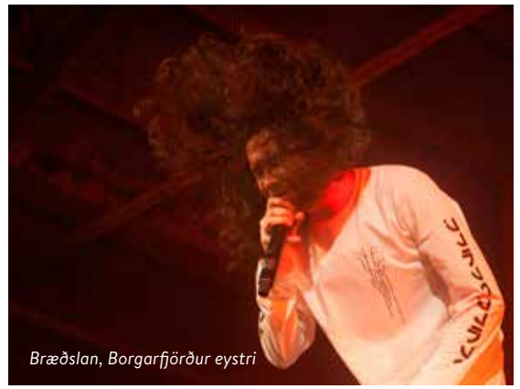
Bræðslan, Borgarfjörður eystri