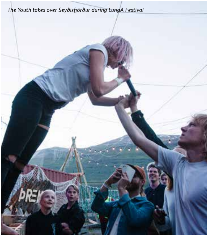
The Youth takes over Seyðisfjörður during LungA Festival