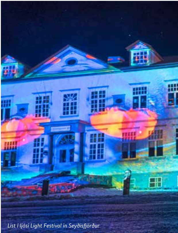
List í ljósi Light Festival in Seyðisfjörður