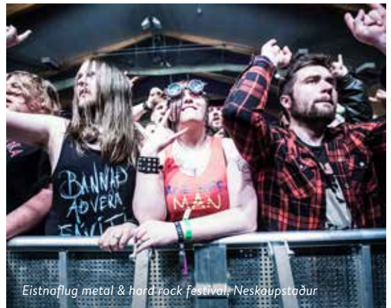
Eistnaflug metal & hard rock festival, Neskaupstaður